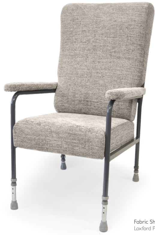
Fabric Shown: Loxford Plain Slate