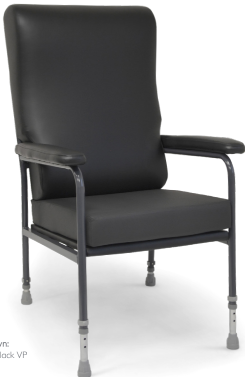
Fabric Shown: Zest Black/Black VP

A range engineered for effortless, tool free adjustments, catering to a broad range of preferences and the ability to add optional wings.