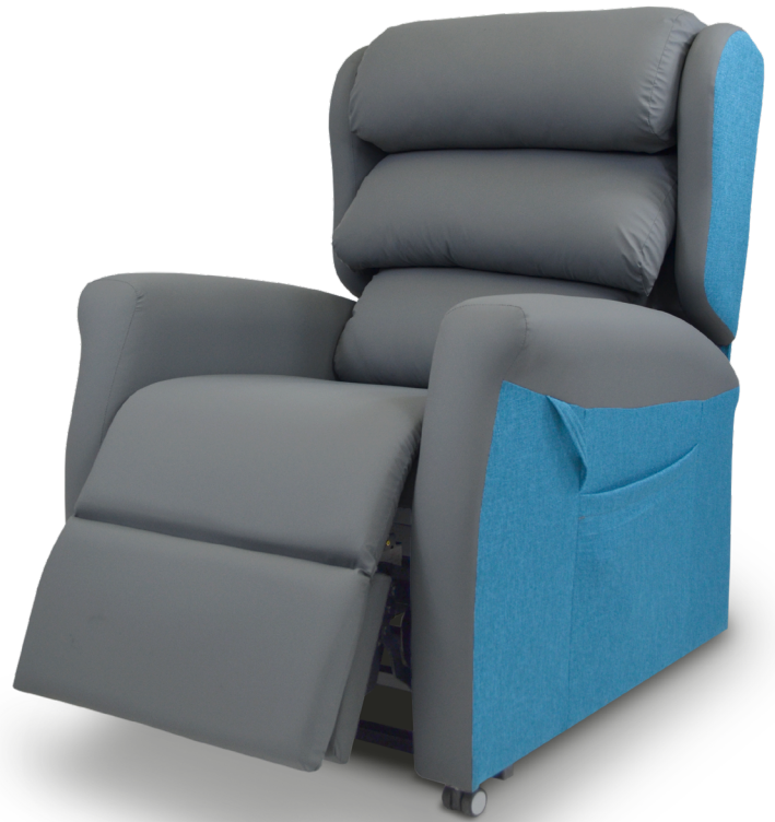
Fabric Shown: Highland Teal & Grey VP

The Concerto offers excellent pressure management solutions and postural support, whilst providing a modern stylish look that complements any environment.